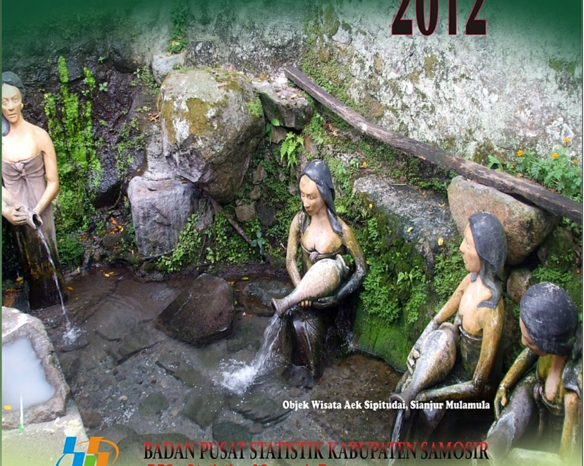
Objek Wisata Aek Sipitudai, Sianjur Mulamula