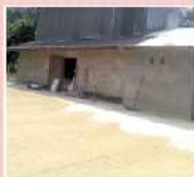
Industri Penggilingan Padi