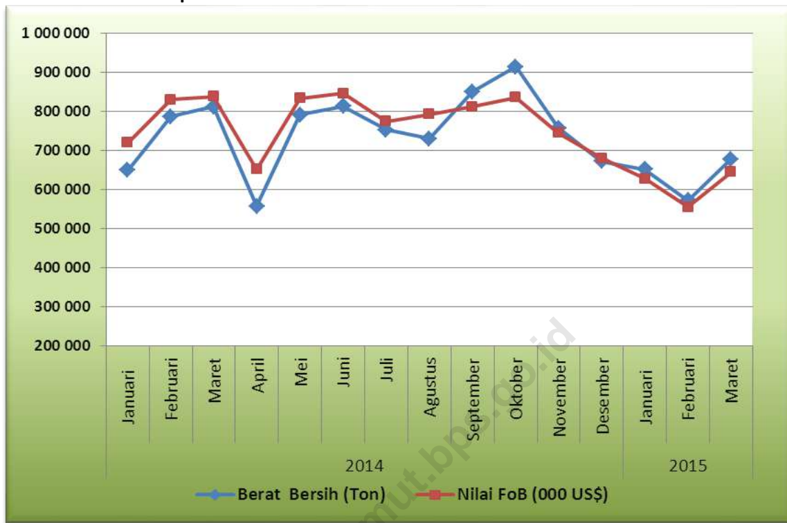
Grafik 1. Ekspor Provinsi Sumatera Utara Januari 2014 – Maret 2015

Rata-rata nilai ekspor Januari-Maret periode 2010-2015 adalah sebesar US$2.290,79 juta dengan rata-rata nilai ekspor sektor pertanian dan peranannya US$678,60 juta (29,40 persen), ekspor sektor pertambangan dan penggalian sebesar US$ 2,08 ribu (0,08 persen), ekspor sektor minyak dan gas bumi sebesar US$ 37 ribu (0,00 persen), ekspor sektor lainnya sebesar US$ 12 ribu (0,00 persen), dan ekspor industri sebesar US$1.610,07 juta (70,52 persen).