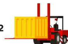
Lanjutan tabel. 6