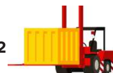
Tabel 4. Impor Kota Batam Menurut Negara Asal Barang Tahun 2022