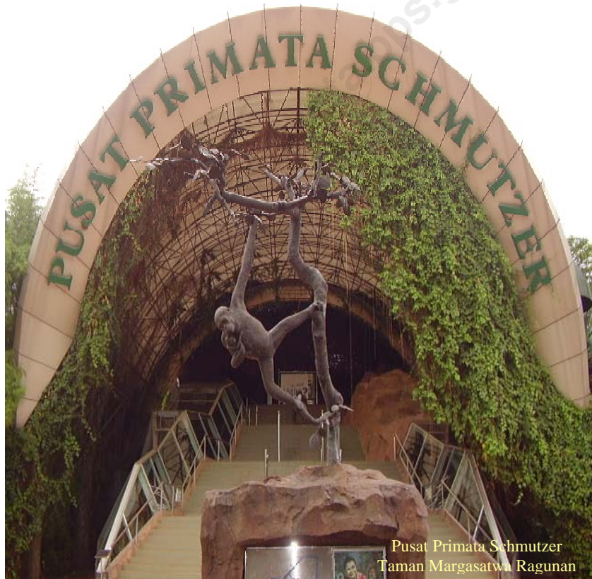
Pusat Primata Schmutzer Taman Margasatwa Ragunan